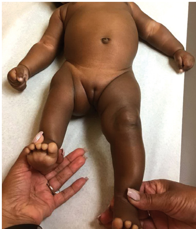
Fig. 3. Proximal femoral focal deficiency. Photograph of the infant at 3 months of age. Short right lower extremity

As stressed in the literature, prenatal diagnosis of PFFD is important, because early recognition of this malformation could provide useful information to parents and physicians regarding management and therapeutic planning (4,5) . Prenatal ultrasound is widely used to