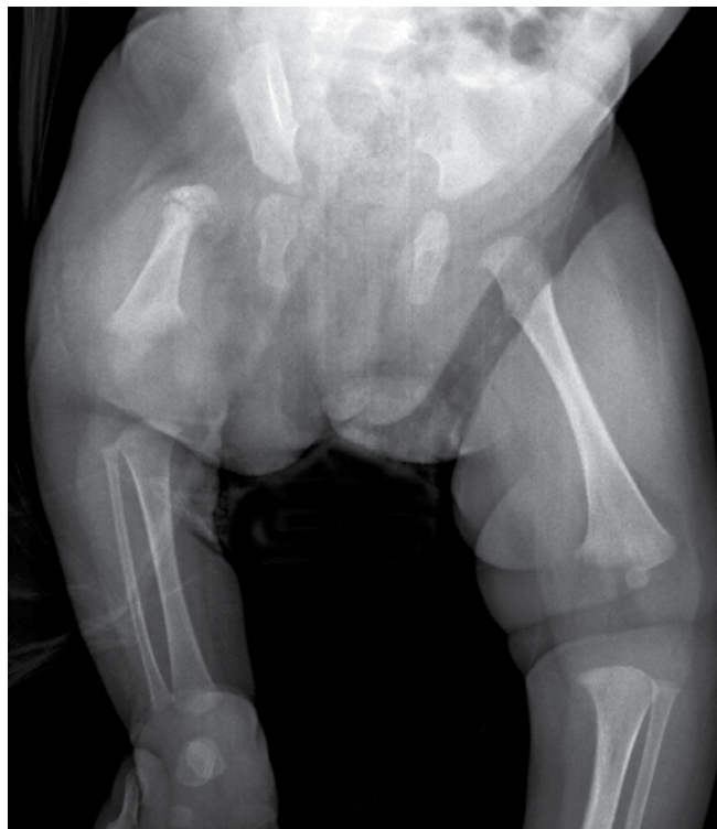
Fig. 4. Proximal femoral focal deficiency. Radiograph of the lower extremities at the infant's age of 2.5 months demonstrates a short right femur associated with pseudoarthrosis of the femoral neck, superolateral subluxation of the hip and symmetrical length of tibiae and fibulae

nal abnormalities, as reported in other cases. Regarding the possibility of femoral–facial syndrome in which facial abnormalities are observed, we could not recognize any on ultrasound, but the genetic consultation at an age of 3 months observed a prominent forehead, mid-facial hypoplasia with flat nasal bridge, hypertelorism, bilateral telecanthus and micrognathia. It is likely that